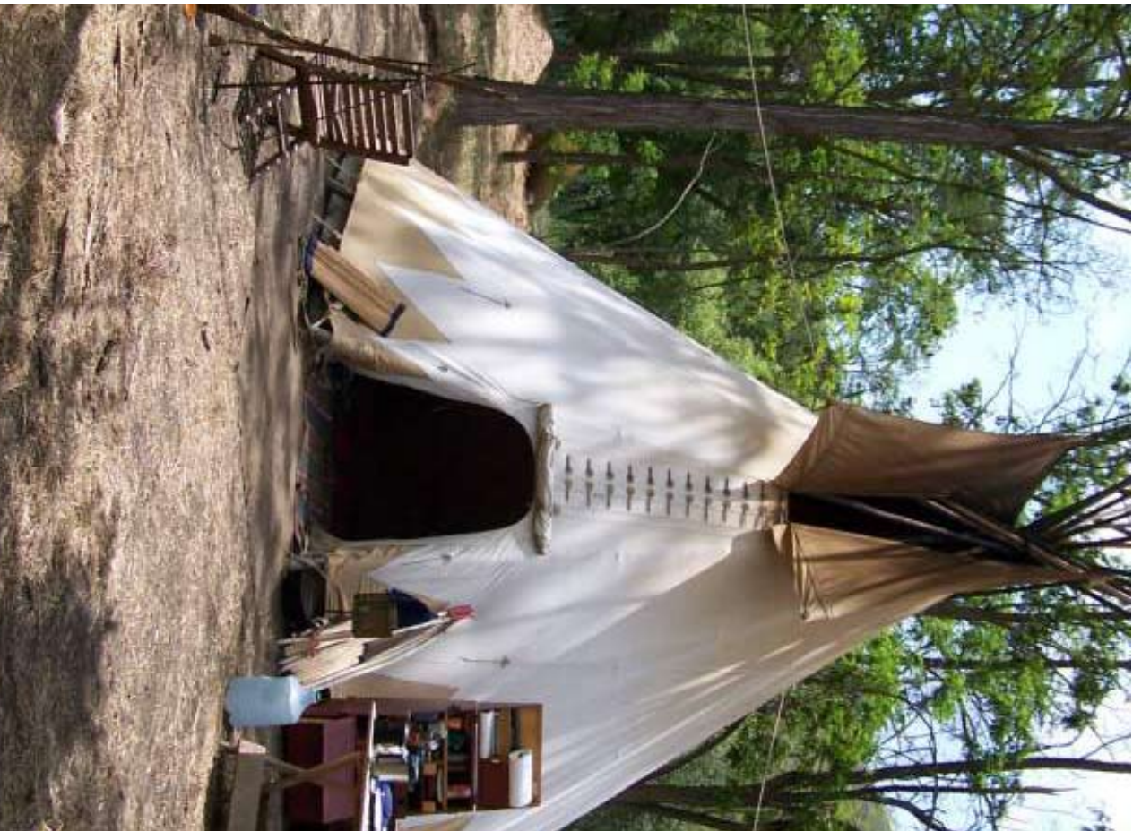
TeePee set up at 2007 Invitational Rendezvous