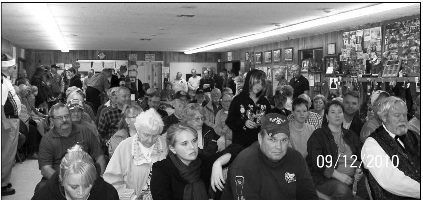
Members at the Christmas 2010 meeting.