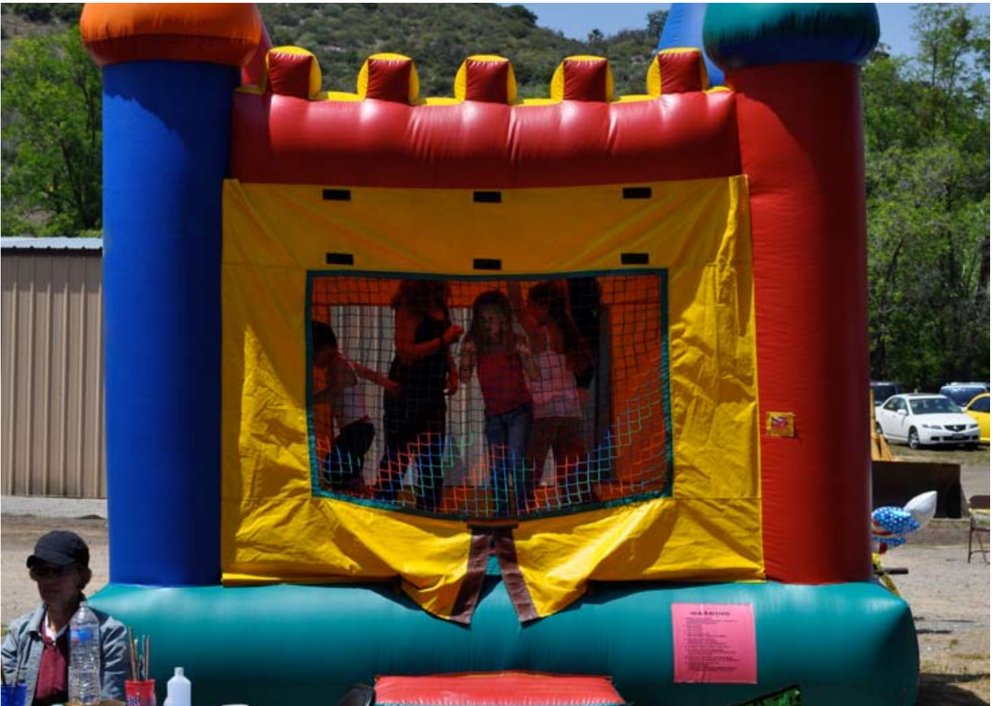
Above: Children enjoying the Jump House at the BBQ.