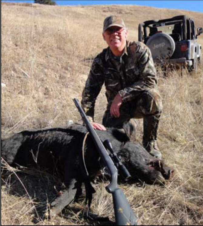
250# hog taken near Paso Robles on November 3, 2010 with a .50 caliber Thompson Center Omega muzzleloader. It was shot at 59 yards and ran about 200 yards before piling up.