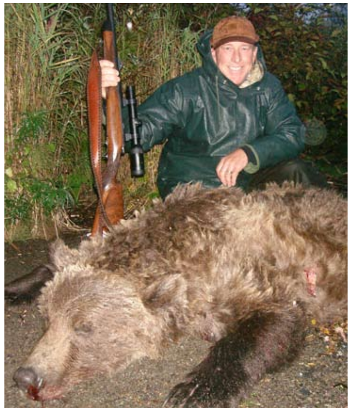
Alaskan Brown Bear on 9/14/11 in the Woods/Tikchik park in Alaska