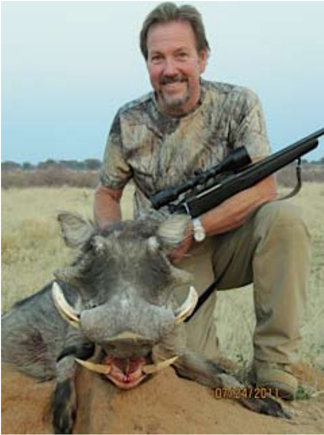
Old Warthog, taken in Namibia July 2011, 375 yard shot, offhand!